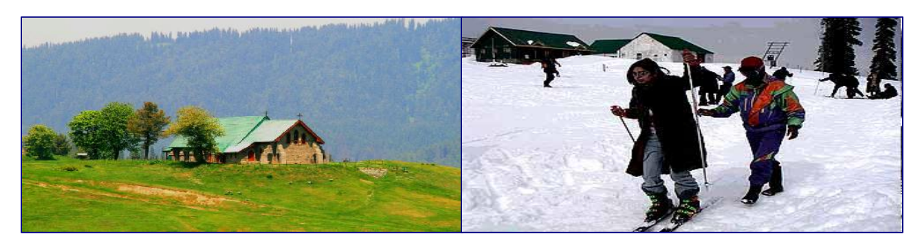
The journey to Gulmarg is half the enchantment of reaching there - roads bordered

country. Originally called 'Gaurimarg' by shepherds, its present name was given in the 16th century by Sultan Yusuf Shah, who was inspired by the sight of its grassy slopes emblazoned with wild flowers. Gulmarg was a favourite haunt of Emperor Jehangir who once collected 21 different varieties of flowers from here. Today Gulmarg is not merely a mountain resort of exceptional beauty- it also has the highest green golf course in the world, at an altitude of 2,650 m, and is the country's premier ski resort in the winter.